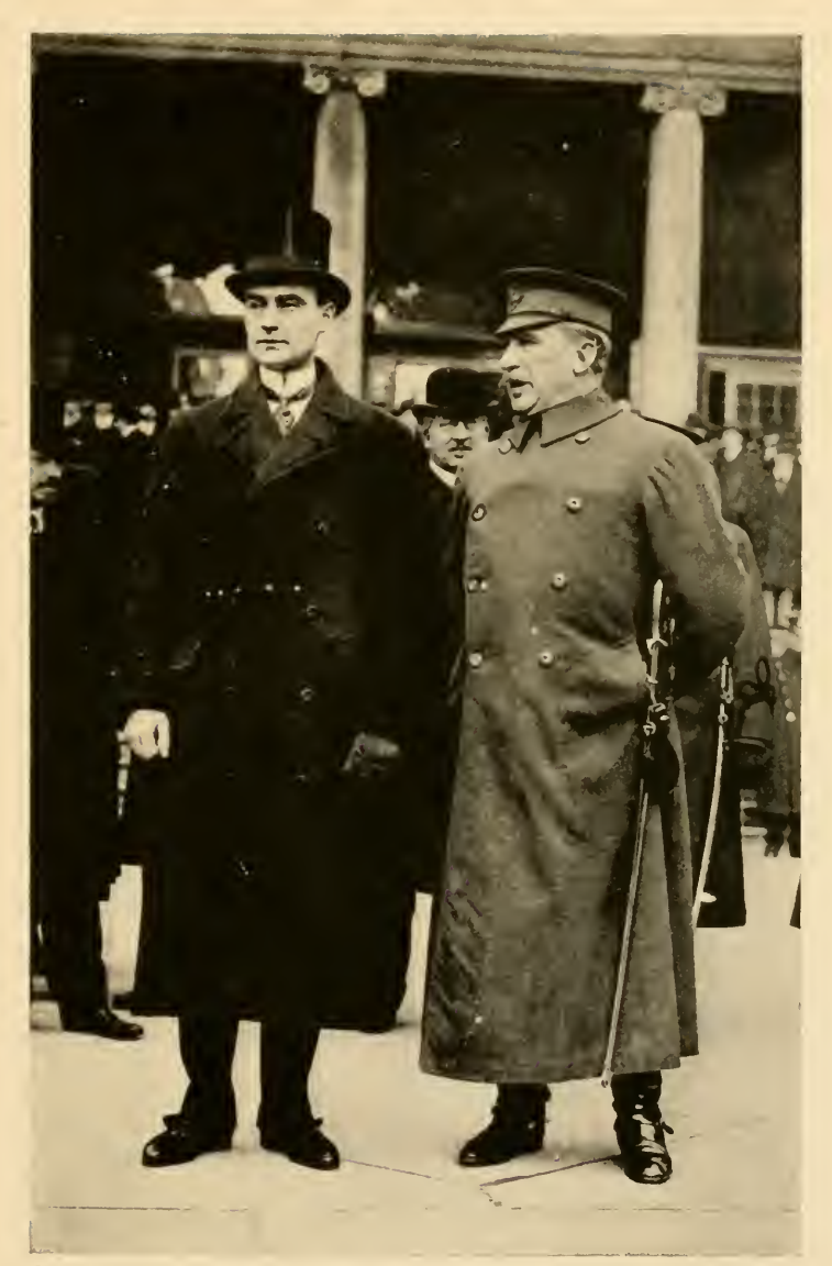
Mayor Mitchel and General Wood reviewing parade of the Alaska soldiers at New York City Hall